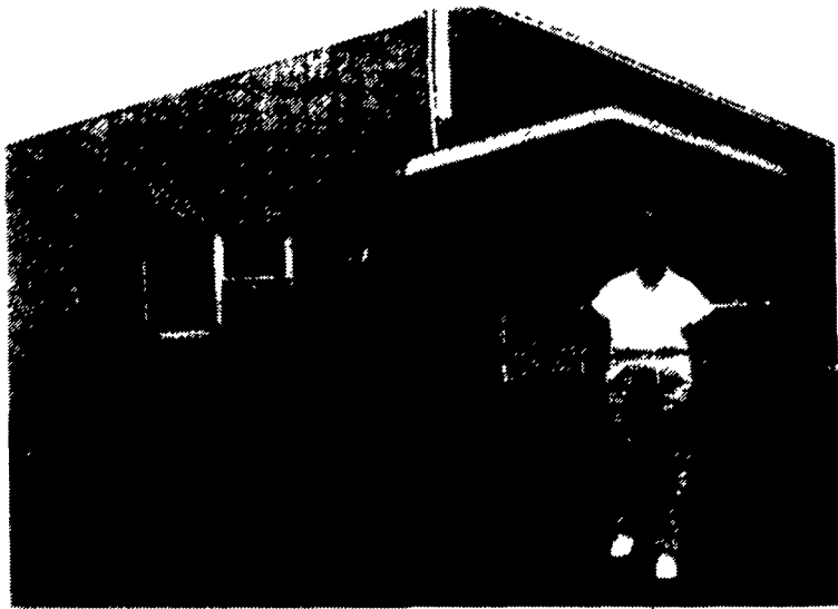
Shirley enjoys greeting customers and developing new recipes. In the background is the store that at one time was used to dress the homegrown turkeys.