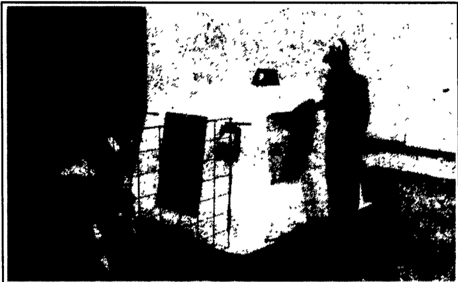
#1 Selling Calf Nursery in the World

At Ag Progress Days See Us At End Of West 10 th St.