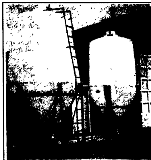
Poly Feed Bins to 6 1/2 Ton Capacity

Special Show Discounts For Orders At Show