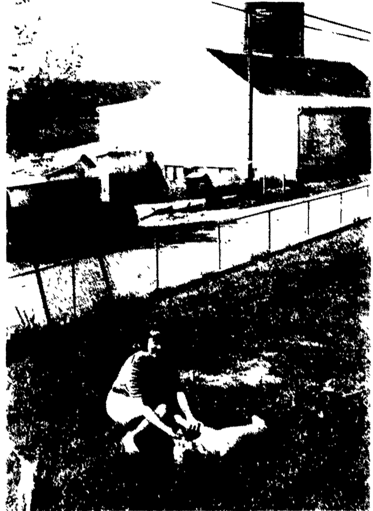
Seidel's dairy farm has been in the family since the 1800s. Love for Grange activities has also been passed down through the family, and one that Pam promises to pass on to others.