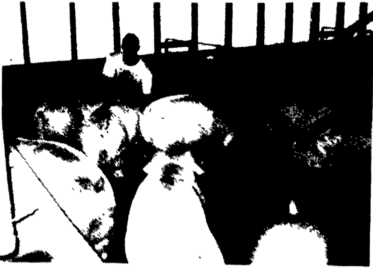
The Buffington farm in Millersburg specializes in raising 2,500 head of market pigs.

For more on the Grange, write to National Grange, 1616 H St. NW, Washington, D.C. 20006-4999 or call 202-628-3507.