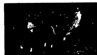
Child's Pony Pedal Cart