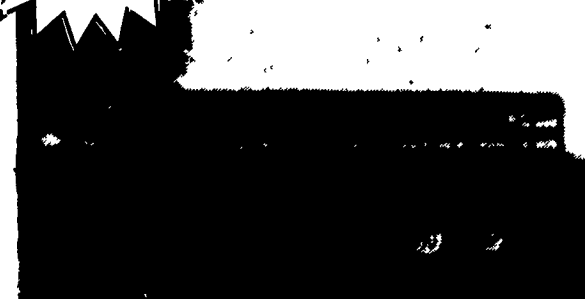
Model SG166E (Shown with standard sides)

ALL TRAILERS EQUIPPED WITH RUBBER TORSION AXLES