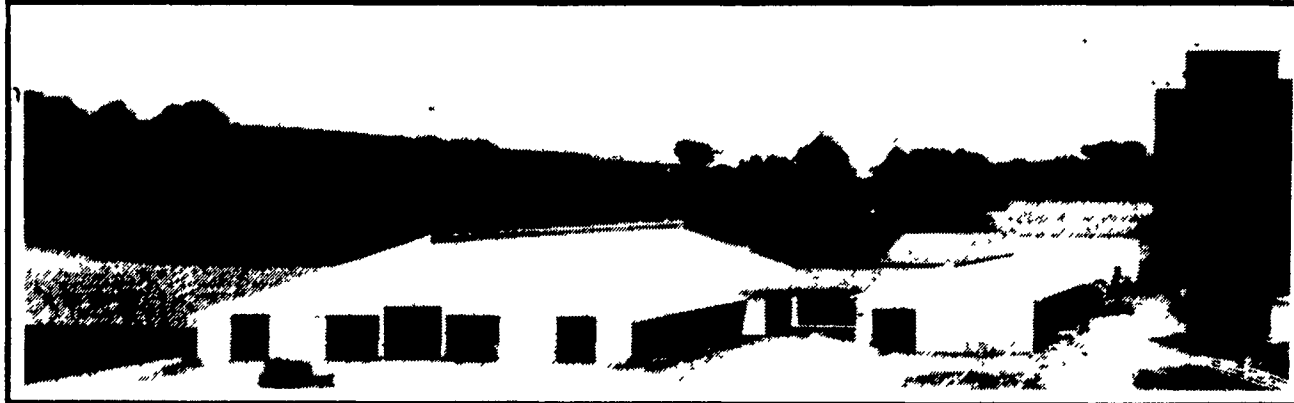
DAIRY COMPLEX (Freestall Barn and Milking Center)

Planning to expand or update? Check With Agri-Inc. where quality is our standard.