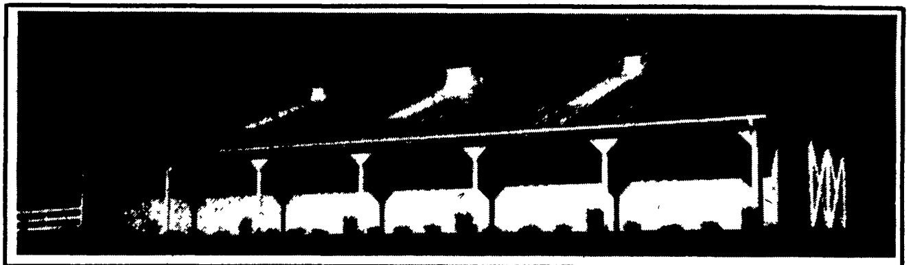
HORSE STALL BARN