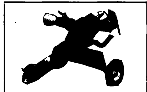
Caprani Water Pump

MID-ATLANTIC OXFORD, PA AGRI SYSTEMS LIQUID WASTE SPECIALIST 800-222-2948