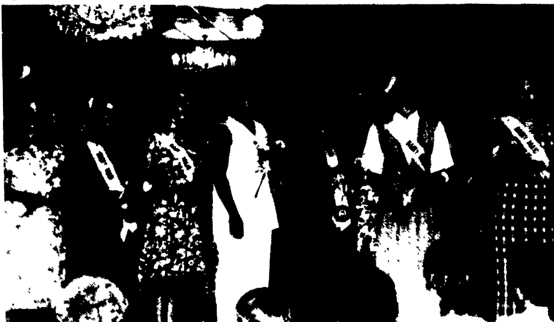
These 13- to 16-year-old dairy maids will assist the dairy princess in promotional duties.