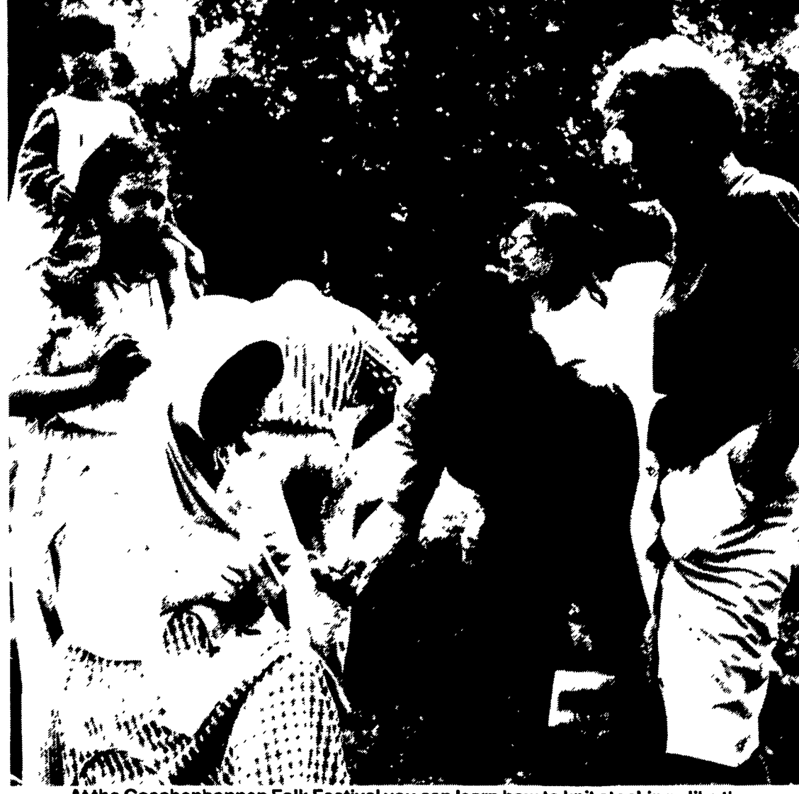
At the Goschenhoppen Folk Festival you can learn how to knit stockings like those worn in the 18th century. The Festival will be held August 12, from noon to 8 p.m. and August 13, from 10 a.m. to 6 p.m. It is located in the village of East Greenville, northern Montgomery County on Third Street, just off Route 29. Adult admission is $6, children under 12 free.

Lancaster Society of Farm dence. The next meeting will be on September 14 and will be held at Reich's Church in Marietta.