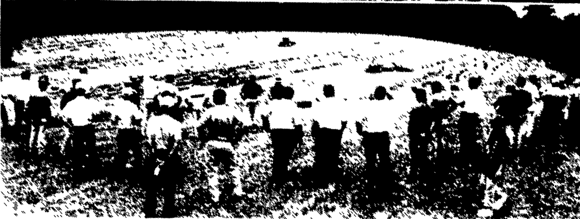
Above, the the crowd watches the square-bale and raking equipment at work. Below, the round-balers work.