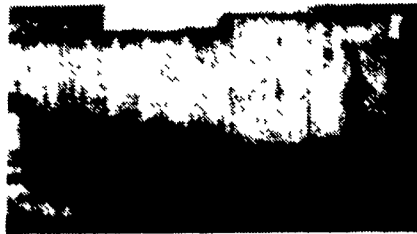
Trailmobile 22' Dump Trailer $2,500

CAT 955L S/n 85J-8728 Good condition 400 hrs. on rebuilt engine, U/C 20% $18,000 (717)658-6529