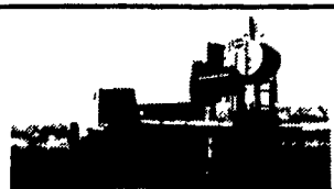
1987 Reince 1000 gallon Hydrograsser, 200' elec. hose reel, top gun, mounted on LT800 Ford