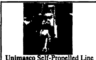
Unimasco Self-Propelled Line Painter (2) guns, 10 gallon tank, 14.1 CFM compressor, operator's trailer