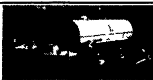
AMZ Patching Machine, rotor gun, aggregate feeder, high volume air blower, new emulsion tank, articulated boom (purchase or rent)