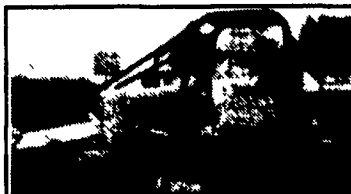
JD 550 w/ 6 Way, New UC & Rebuilt Trans.