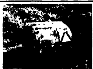
Galion 5-ton tandem, Wisconsin gas engine