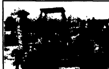
586 Case 6000 Lb. Forklift