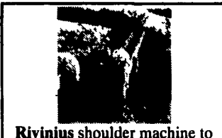
Rivinius shoulder machine to mount on grader, engine powered conveyor 22" wide x 26' long, adjustable height