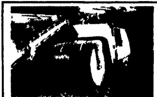
Austin Western (10-14') Tandem Roller GM 4 53 diesel hydrostatic, needs engine work