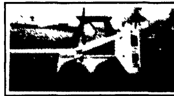
843 Bobcat Diesel, GP Bucket, Nice Condition $10,500