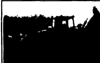
JD 510B Turbo Tractor/Loader/Backhoe $19,900

Skid loader rental. Terre Hill. 717-445-9864 ask about deliveries.