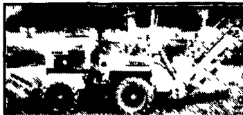
Vermeer Ditcher w/Deutz Diesel & 6-Way Blade, Nice $6,500