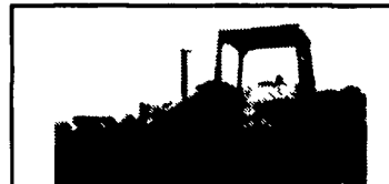
84 Case 1455B, 3000 Hrs., w/Ripper $24,900