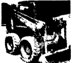
Gehl 4615 Skid Loader, Diesel, New Rubber, Aux. Hyd., Good Condition $9,800