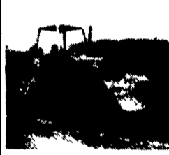
JD 655B 4-1 Bucket, Good Condition $32,000

Weaver's Track & Tire Equipment Sales RD#3, Box 849, Milton, Pa Phone 717-742-2712 No Sunday Calls