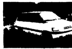
1992 Mazda MPV Mini Van, 20K Mi., V6, 8 Pass., Loaded, Super Clean, $11,800