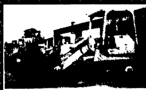
Caterpillar 955K Crawler Loader w/ult. Canopy $12,500.00

Heavy Equipment Loader Parts, Inc. RD 2, Box 2230, Route 22, Grantville, PA 17028 717-469-0039