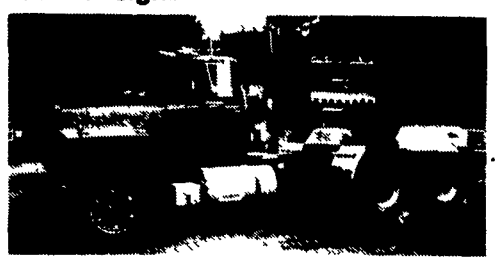
1993 Mack R600 Conventional

LOCATION: From Morgantown, PA (exit 22 of PA Turnpike). Take I-176 North approximately 10 miles to Route 724 (Exit 3 Shillington). Turn right on Route 724 East. Proceed approximately 5 miles to Route 82. At stop light turn right, then immediate 1st left to auction site at Birdsboro Steel Plant. Look for signs.