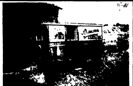
Milk Delivery Wagon - Original Condition

Directions: From Pennsylvania Turnpike to Exit 20 (Lebanon-Lancaster), (5.4 miles to auction site). After exiting turnpike, go North on Rte. 72 at 2nd traffic light turn right onto Rocherty Road and proceed to Fairgrounds. From the South: Take Rte. 72 North and proceed as described above. From Lebanon: Proceed on 10th Street (Rte. 72 South) until it intersects with Cornwall Road. (At Quality Inn) go South on Cornwall Road for about 2 miles, turn left at 1st traffic light and proceed to fairgrounds.