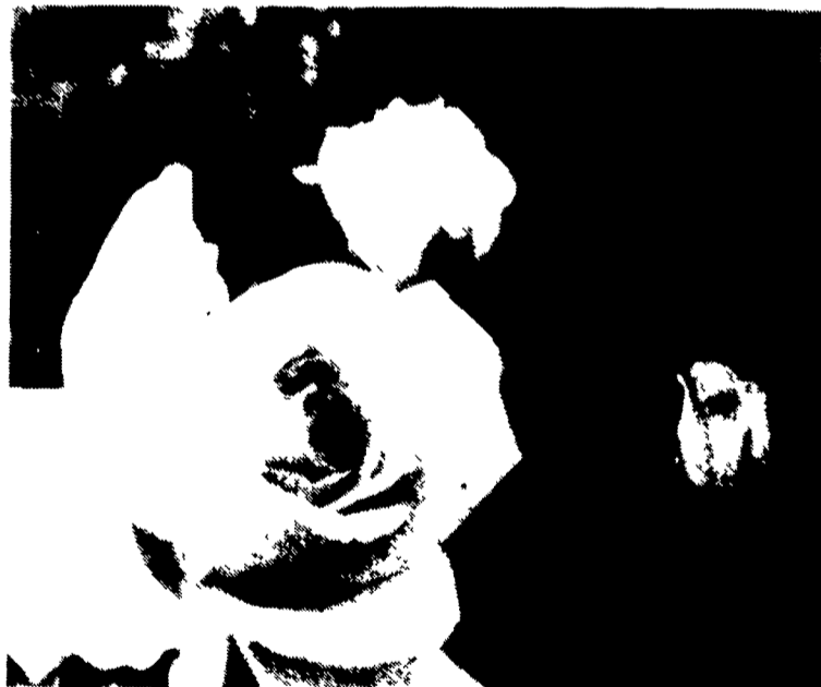
A delicate rose remains a favorite among flower lovers.