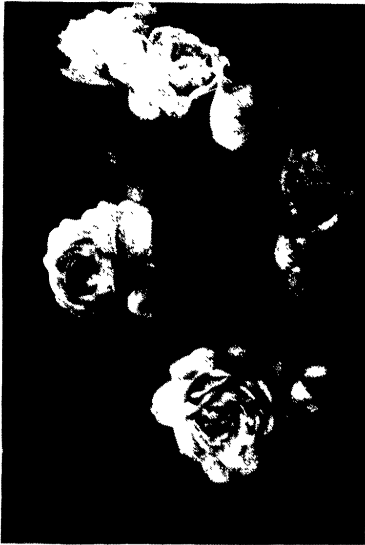
Rose bushes should be planted where air circulation can dry off the morning dew quickly in order to prevent disease.