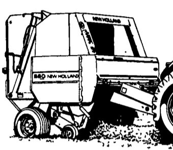
All Models In Stock!

Leasing and Financing Available On All Models of Ford New Holland Equip.