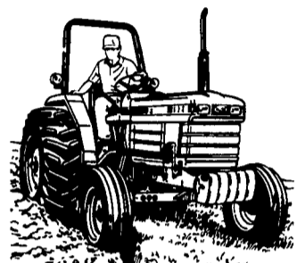
All Models In Stock!