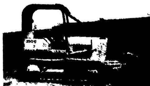
JD 350 C 6-Way $12,500