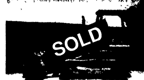
Komatsu D31S $12,750