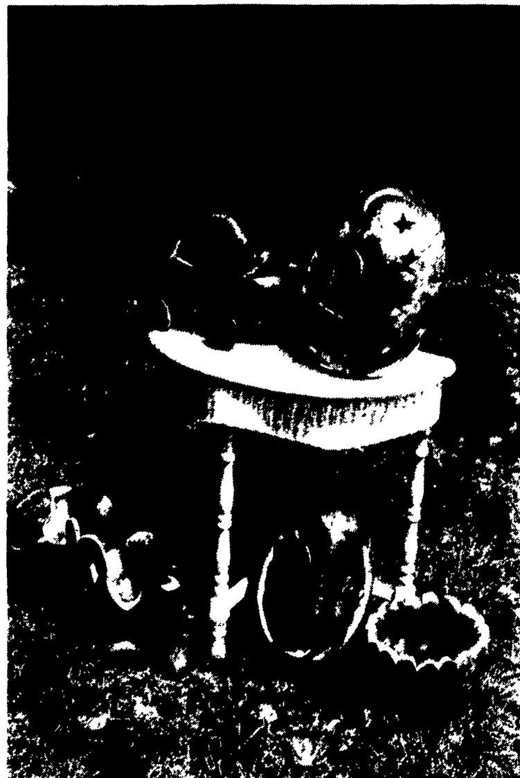
Prizes will be given to the best watermelon sculpture.

"Country Living" magazine will feature an article about the "Watermelon Festival" in their upcoming August issue. For information send a long SASE to "Watermelon Festival", P.O. Box 212, Shartlesville, Pa. 19554 or call (610) 488-7792.