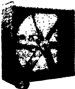
48" Fan With 1 HP Motor

36" Portable Economy Model With 1/2 HP High-Efficiency Motor