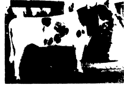
8H2347 Peti +$301 MFP +2,968M +1.37 PTAT

All are graduates of our sampling program, giving you full confidence in every Atlantic sire you use.