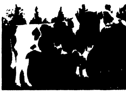
NEW: 8H2553 Ellsworth +$305 MFP +2,849M +75P