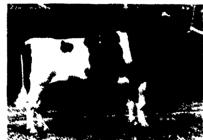
8H2215 Destruction +$329 MFP +3,268M +1.33 PTAT