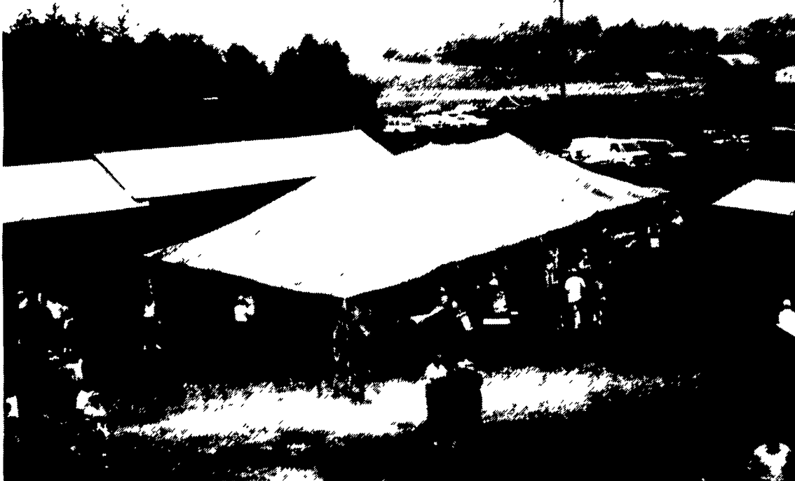
Bird's-eye view from the silo at Gray Valley Farm, taken by Ray Owlett.