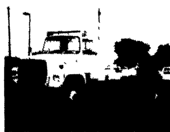
89 FORD L8000 33,000 GVW Air Brakes, 7-8 Liter Eng., 6 Speed, Cab & Chassis $19,500