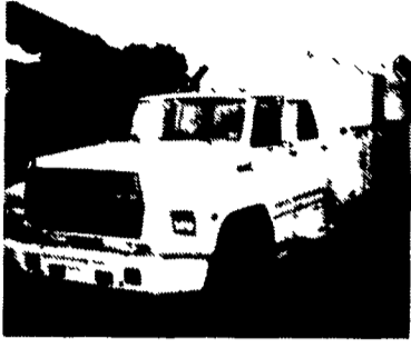
1985 F-600 8 2 Diesel, Auto, 5 Man Cab, Utility With Rollup Door On Rear, Clean, Low Mileage, 1 of 3.

Huntingdon Valley, PA • 215-672-9667 • 1-800-543-3833 • Eddle