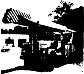
Holan 70' Double Bucket 75' working height mounted on 1981 Western Standard, 6x6 Flatbed, CAT 3208, Auto