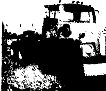
1970 Ford 800 V8 5 Speed with Aux. Trans, 39,000 GVW, VAC Brakes 13'4" Fran Fleet Maintained, 73,000 Miles.