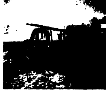
International Presser Digger This Unit Is Ready To Work, Priced For Quick Sale $9,500 $8,500