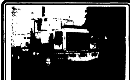
83 General GMC w/wet line w/Budd wheel $10,500 OBO 717-529-2512

Wilson 40' Double Deck Hog Trailer, $2000. (717)872-8508.