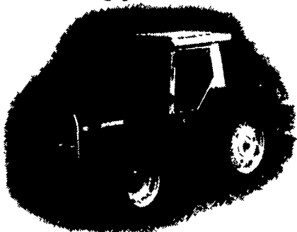
MF 3100 and 3600 tractors deliver up to 170 hp and the technology to make you a superior farmer.