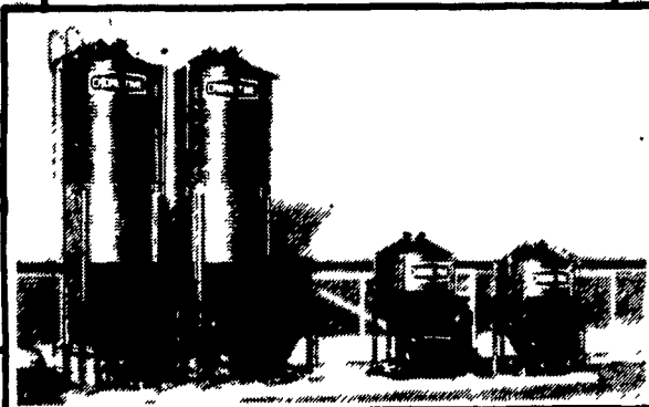
Bins... Large Or Small