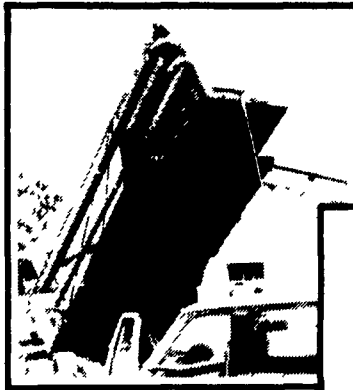
Take 'em Down!

We Stock Truckloads Of Chore-Time Bins & Miles Of Chore-Time FLEX-AUGER