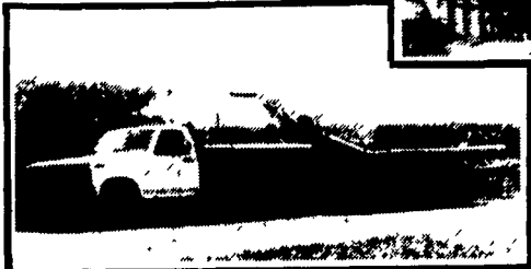
We Will Assemble & Deliver Bins To Your Farm