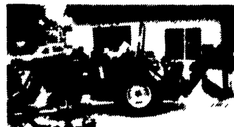
Case IH 1140 4x4 Tractor/Loader/Backhoe Hydro, Only 138 Hrs., Ex. Cond.