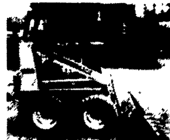
Case 1816B Skid Loader Ex. Cond., Great For Tight Areas