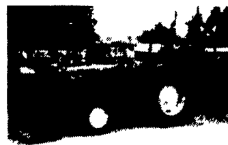
JD 1050 4x4 w/Loader And 1 Yr. Old Arps 90 Backhoe 712 Hrs., Ex. Cond.