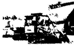
Case 455B Crawler Loader w/Rops Canopy Sweeps, GP Bucket $15,500