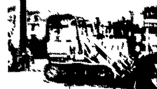
John Deere 555 Crawler Loader w/4'1 Bucket, Rops Canopy $14,500