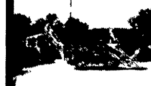
John Deere 455D Crawler/Loader/Backhoe w/GP Bucket, Rops Canopy $22,500