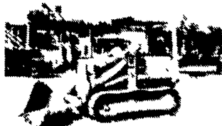
CAT931 Crawler Loader w/Rops Canopy, GP Bucket $13,500