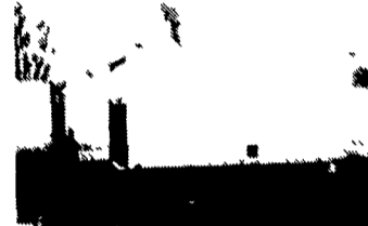
DRY & REEFER BODIES - 12 Ft. to 24 Ft. For Over The Road Or Storage. $200.00 And Up.

LANCASTER'S LARGEST GM Truck Dealer & We're Getting Bigger