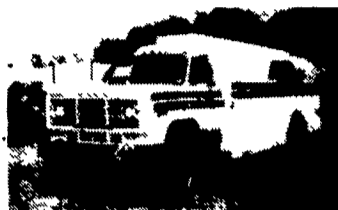
1982 GMC 7000 V8, 5+2 Spd, 69,000 Miles, Tilt Front End, 35,000 GVW, P/S, A/B with or w/Out 3000 Gal. Steel Fuel Tank, Pump & Meter (5 Other Tank Trucks)