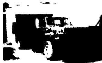
1988 F 700 V8, 5 Spd., 16 Ft. Flat Bed Liftgate Front, Mounted Winch, Only 18,000 Miles, 23,000 GVW, Inspected, Excellent Condition