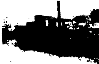
1980 IH 3208 Cat - 5+2 Spd, Crew Cab, 9 Ft. Dump, 85,000 Miles, Excellent Shape.

560 Lampeter Rd., Lancaster, Pa. 17602 (717) 392-6266 (717) 299-6200 TRUCK PARTS, MOTORS, TRANS-REARS-TIRES, DUMP BODIES-REEFER BODIES (OVER THE ROAD & STORAGE)