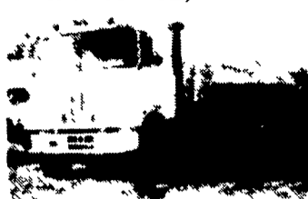
1982 Mack - 300 HP - 5 Spd, Air Ride, Sliding Fifth Wheel, Jake Brake, Also S/S & Alum. Tank