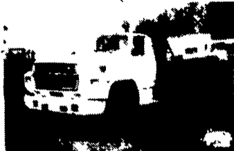
1985 F 700 Ford V8, 5+2, 14 Ft. Flat bed 24,500 GVW, Trailer Hitch & Brakes, 67,000 Mi, Clean Truck, Inspected