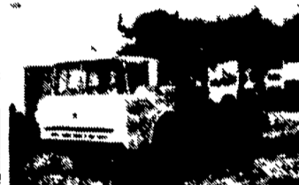
1974 CO800, V8, Auto 13 Ft. Flat Bed with POWERS Crane & Winch, 70,000 Miles, Truck in Very Good Condition.