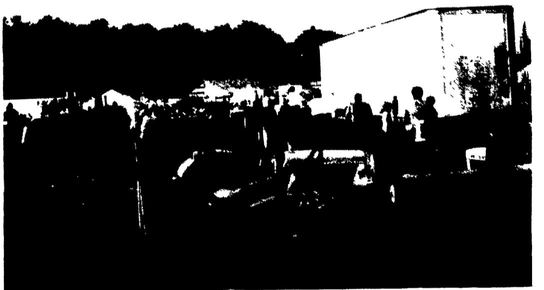
Displays of old-time crafts, tools, or machinery are welcome. Flea and craft markets will also be there, but the main attraction as always will be the countless antique tractors and steam-propelled equipment that will be on display.