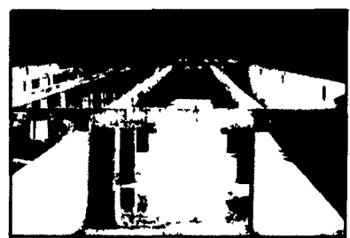
Concrete Pit Set-Up For Slatted Floors

Invest in Quality - It will last a lifetime.