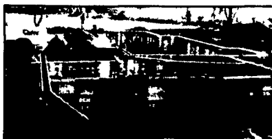
House Foundation Wall