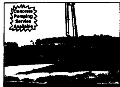
92' Boom Placing Concrete