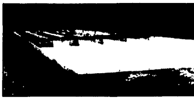
Manure Storage For Hog Confinement