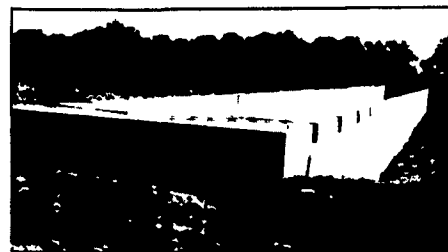
300' Long Manure Pit For Hog Confinement