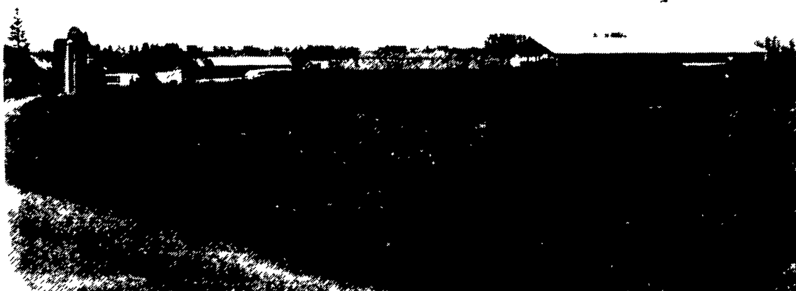
Visitors to this year's Animal Housing Expo, scheduled July 12-13 at the Lebanon Fairgrounds, can take a tour of this extensively renovated and modernized dairy farm in Lancaster County.