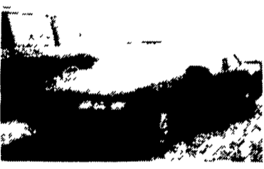
1992 Lumina Euro 3.1 Auto, Air, Elec. Windows & Locks, Cruise, Tilt, 22,000 Miles, Black, Make Offer