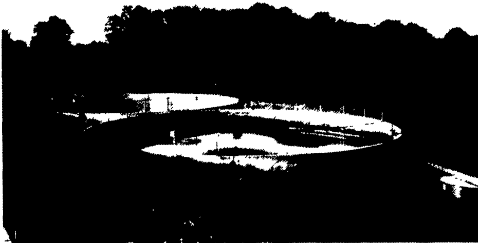
Partial In-Ground Tank Featuring Commercial Chain Link Fence (5' High - SCS approved)

• Agricultural • Commercial • Residential