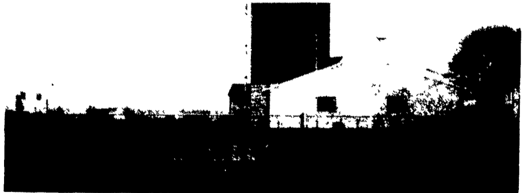
65' Diameter SCS Approved Circular Manure Storage

Specializing In Manure Storage Round or Rectangular In, Ground or Above Ground