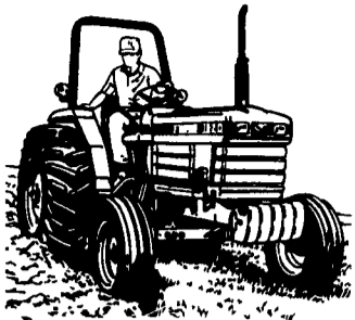
All Models In Stock!