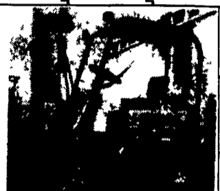
7,000 Lb. Hyster, LPG, Sideshift, Very Good Condition $5,000