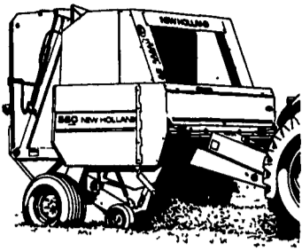
All Models In Stock!

Leasing and Financing Available On All Models of Ford New Holland Equip.