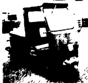
Cushman 3-Wheeler w/Utility Box, Cab & Take-Off Curtains Special- $795