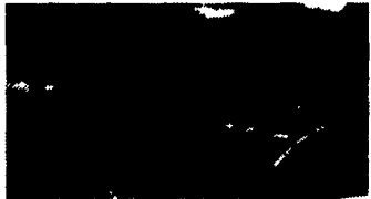
JD 13 Ft. Grain Platform w/Hume Reel $1,995 & 16 Ft. Grain Platform $2,900