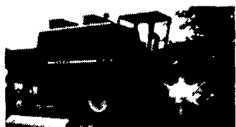
JD 6600 Combine w/13 Ft. Grain Table $10,000