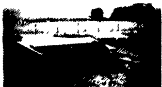
JD 1219 Mower Conditioner Excellent Condition A Steal At $4,995