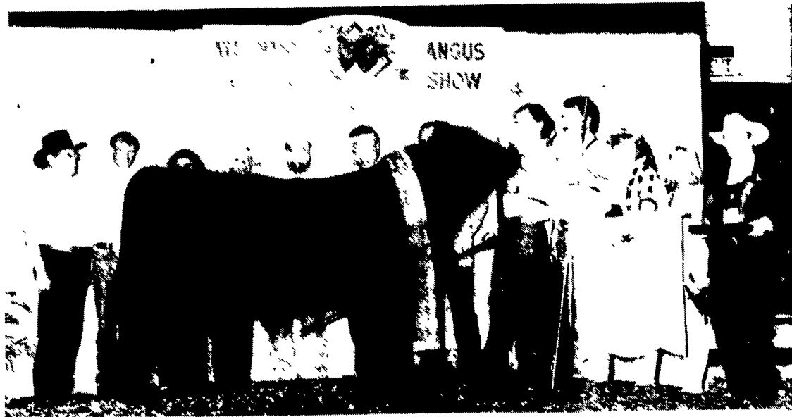
This January 1993 son of Hoff Hi Flyer S C 7134 was named the grand champion bull and supreme champion entry at the 1994 Atlantic National Roll of Victory (ROV) Angus Show in Timonium, Md. He is named Whitestone Fly Traveler 3006 and first won the early spring bull calf title. The bull is owned by Whitestone Farm, Aldie, Va.