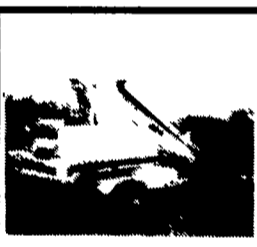
JLG 40' Manlift, Ready to Work $8,000