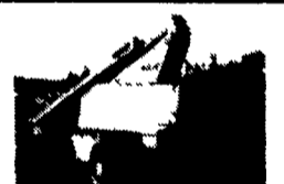
1982 JLG Man Lift, 60' Working Height, w/Extend- able Axles, Rebuilt Ford Gas Engine, Good Condition $18,000