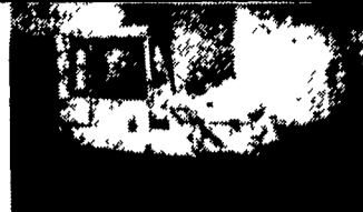
Tennant 92 Diesel Sweeper 4 Cylinder, Perkins Engine, Low Hours- As Is- Needs Transmission $1,900