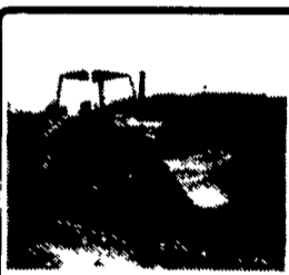
JD 655B 4-1 Bucket, Good Condition $32,000