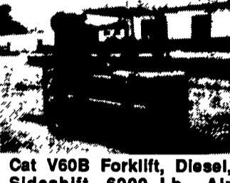
Cat V60B Forklift, Diesel, Sideshift, 6000 Lb., Air Tires, Runs Very Good. $10,500