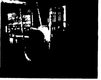
IH 340 Forklift- Gas- Runs Good. $5,900