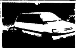
1992 Mazda MPV Mini Van, 20K Mi., V6, 8 Pass., Loaded, Super Clean, Transferable Warranty $14,500