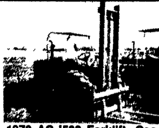
1970 AC 1500 Forklift, Gas, 21', Side Shift, New Paint. $9,500