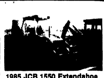
1985 JCB 1550 Extendahoe, ROPS, Runs Good. $13,500