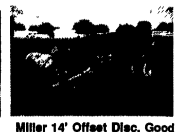
Miller 14' Offset Disc, Good Condition. $3,900

WANTED: Good Late Model Construction Equipment Need S/N And Price When You Call