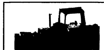
84 Case 1455B, 3000 Hrs., w/Ripper $24,900