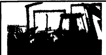
85 Case 580 Super E, 1600 Hr., Excellent $20,500