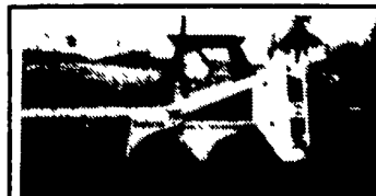
843 Bobcat Diesel, GP Bucket, Nice Condition $11,500