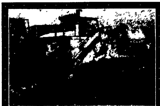
Caterpillar 955K Crawler Loader $12,500

Heavy Equipment Loader Parts, Inc. RD 2, Box 2230, Route 22, Grantville, PA 17028 717-469-0039 800-446-0505