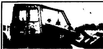
89 Case 1155E w/New Sprocket & Roller & Pins & Bushings, in Excellent Condition $32,500