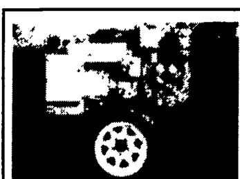
15 KW 3 Ph. Generator With Deutz Diesel