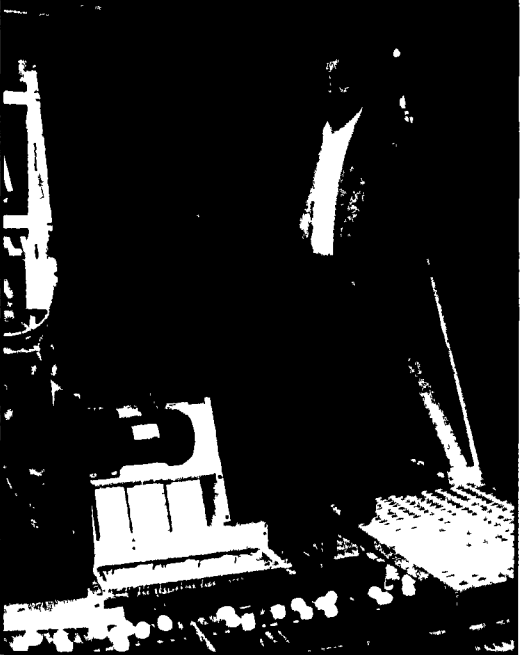
The computer print-outs from the current test* in Turlock, cision forni rm to