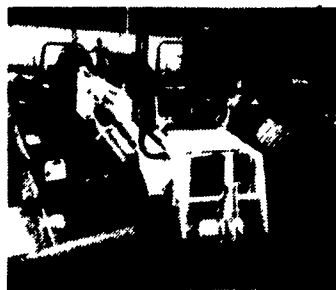
Dit-It 2WD 2/8' Backhoe, Ex. Cond.

Reg. Hours: Mon. thru Fri. 8 to 5; Sat. 8 to 3