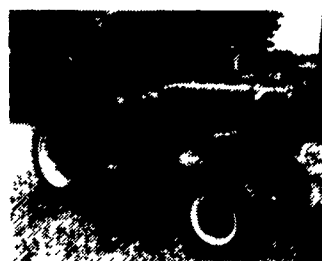
Allis B w/Belly Mower & Front Blade.