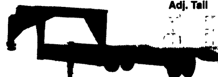
GOOSENECK SIZES: 20'x8" 12,000# or 14,000# GVW, 24'x8" 14,000# GVW