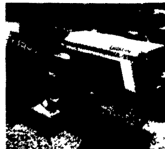
Cub Cadet 154 Cub Low Boy, Ex. Cond.