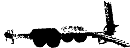
CONSTRUCTION (LOW DECK) 16'x76" 7000# GVW

ALSO AVAILABLE IN 14' DROP AXLE 7000#GVW or 12,000#