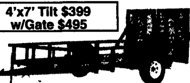
4'x7' Tilt $399 w/Gate $495