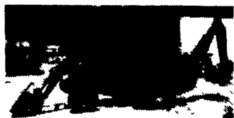
Kubota L4150 4x4, 50 HP, w/Loader, w/or w/o Backhoe