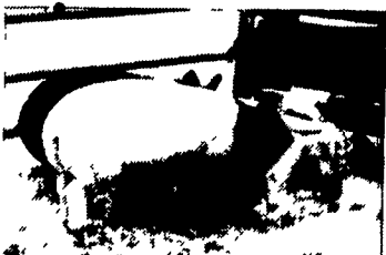
Model HG4 Hog Four-Drink Part No. 18260 31" x 31" x 8" Capacity 160 hogs