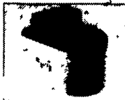
Model CT1 Cattle One Drink Part No. 18271 28" x 20" x 15" Capacity 50 cattle