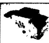
Model HG2 Hog Two-Drink Part No. 18298 31" x 24" x 8" Capacity 80 hogs

Electric-free fountains that live up to the Ritchie® name.