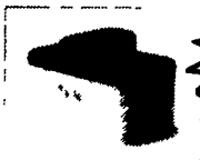
Model CT2 Cattle Two-Drink Part No. 18299 42" x 24" x 15" Capacity 100 cattle