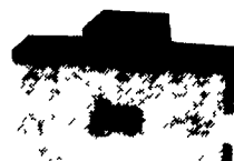
2AC Multi-Purpose Fountain Waters calves, sheep and goats. Perfect for box stalls, small lots or fences. Waters up to 40 cattle/100 calves. Part No. 12295 10" x 24" x 18" high Electric (286W CSA approved)