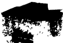
3 Cattle Fountain Designed for big service in small pens. Waters up to 100 head. Part No. 11255 17" x 28" x 26" high Electric (536W CSA approved) or Gas

Recapping Your Ritchie Fountains Makes Sense... And Saves Money!