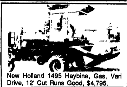
New Holland 1495 Haybine, Gas, Vari Drive, 12' Cut Runs $4,795.