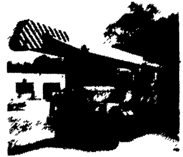
Holan 70' Double Bucket 75' working height mounted on 1981 Western Standard, 6x6 Flatbed, CAT 3208, Auto.