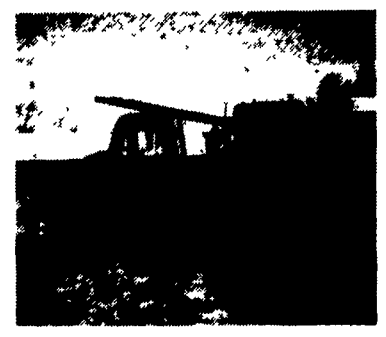
International Presser Digger This Unit Is Ready To Work, Priced For Quick Sale $9,500 $8,500