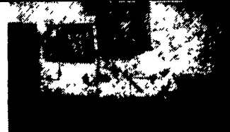
Tennant 92 Diesel Sweeper 4 Cylinder, Perkins Engine, Low Hours- As Is- Needs Transmission $1,900

NIGHTS. PHONE: 717-866-7147 717-273-9089 FAX 717-866-4300