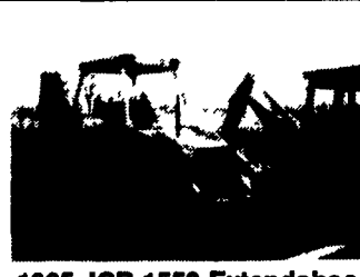
1985 JCB 1550 Extendahoe, ROPS, Runs Good. $13,500