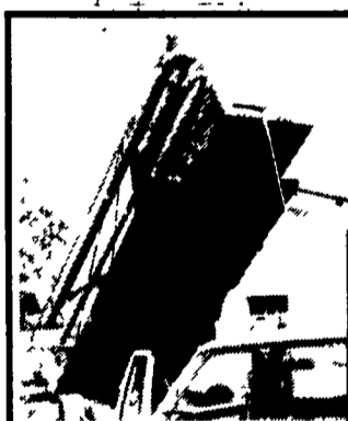
Take 'em Down!

We Stock Truckloads Of Chore-Time Bins & Miles Of Chore-Time FLEX-AUGER