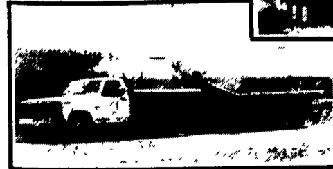
We Will Assemble & Deliver Bins To Your Farm