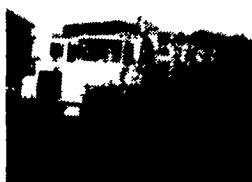
74 Mack U-600 Tri-Axle Dump Truck $19,500