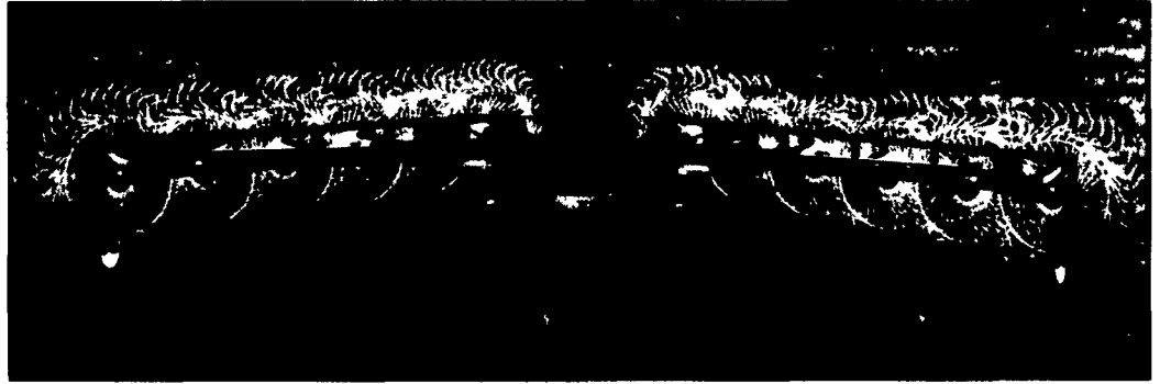
The H&S 12 WHEEL HYDRAULIC OPENING IS PICTURED.

FOUR MODELS TO CHOOSE FROM— A SIZE FOR EVERY OPERATION